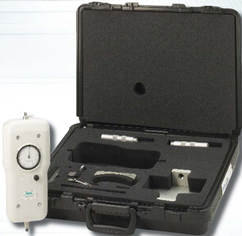
Shown with optional MSCK kit.