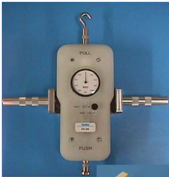
DMG Series shown with standard Handle Set Assembly (p/n SPK-DG-Handle).